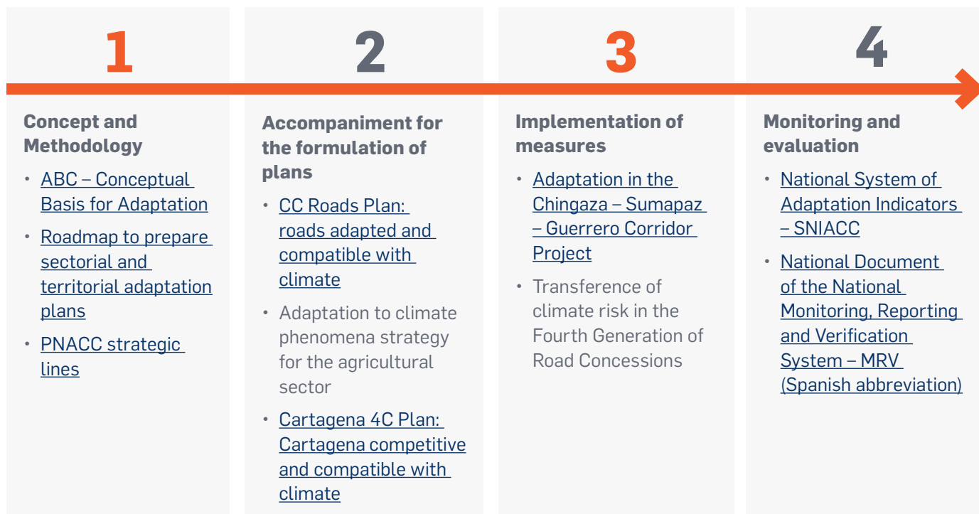
Figure 1. PNACC Phases in Colombia

Subsequently, Colombia published the results of its TCN, including an analysis of risk and vulnerability to climate change based on the collection and analysis of 113 additional indicators that account for threat, sensitivity and adaptation capacity at the municipal level. This showed that vulnerability and risk monitoring can be addressed through different methodologies, and therefore M&E for adaptation should be redefined under a more strategic objective, by evaluating the management and impact of actions and generating learning processes on adaptation (Olivier et al., 2014).